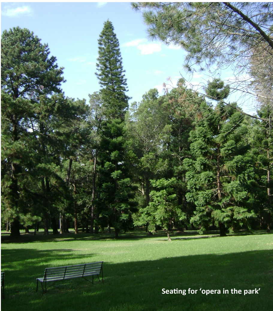
Seating for 'opera in the park'